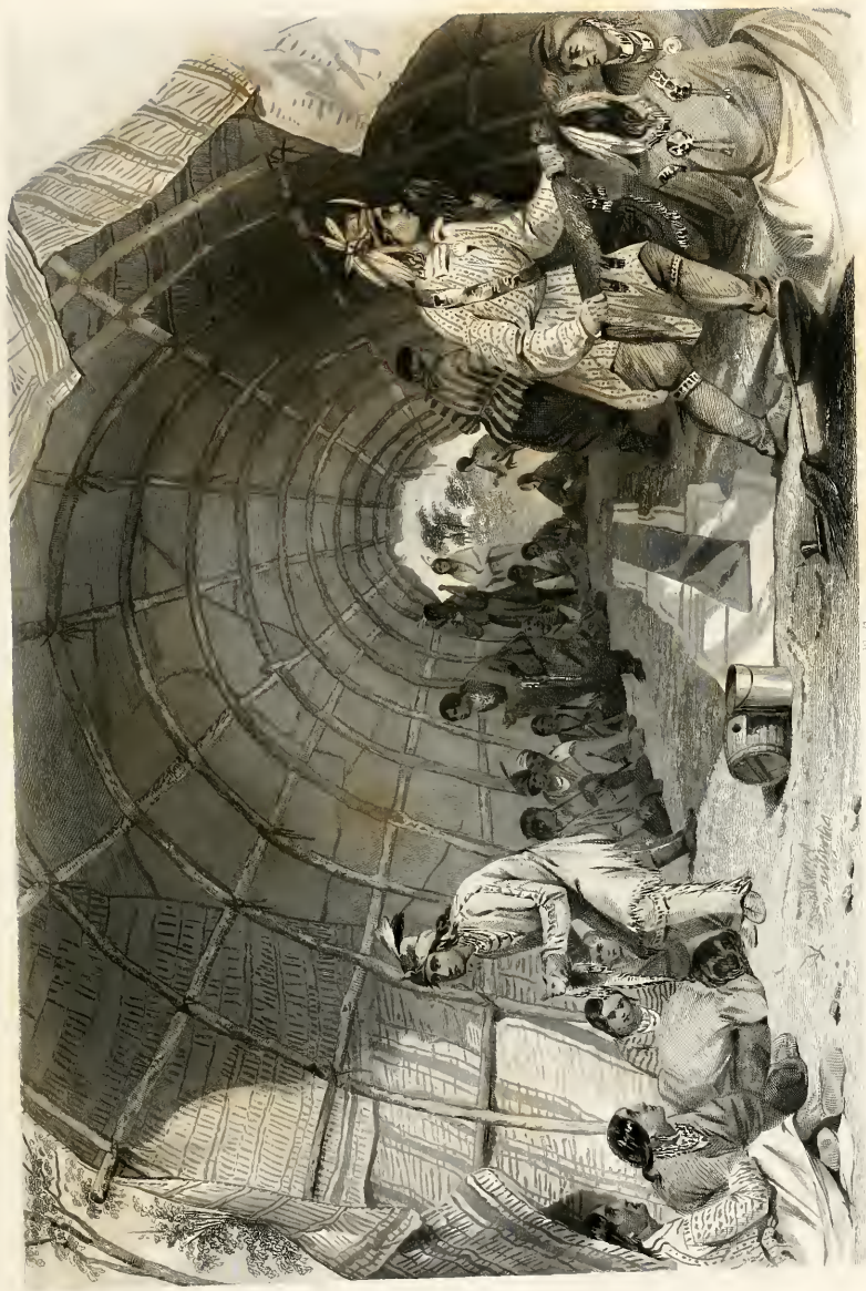
MEETING INSIDE OF THE WINNEBAGO LODGE